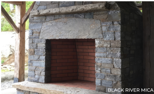
BLACK RIVER MICA