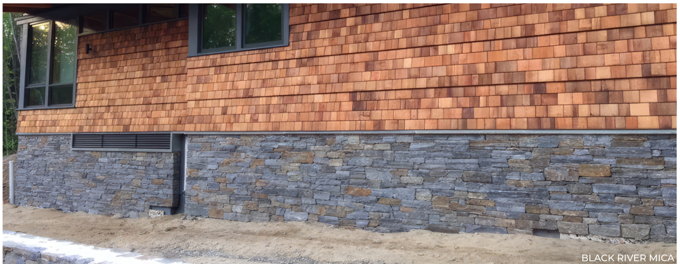
BLACK RIVER MICA